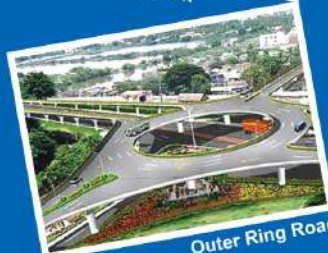
Outer Ring Road