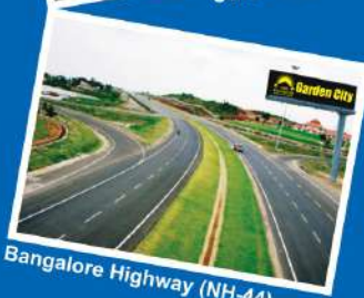
Bangalore Highway (NH-44)