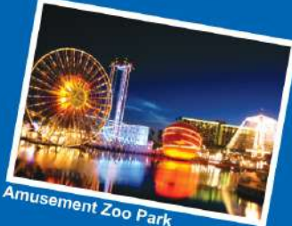
Amusement Zoo Park